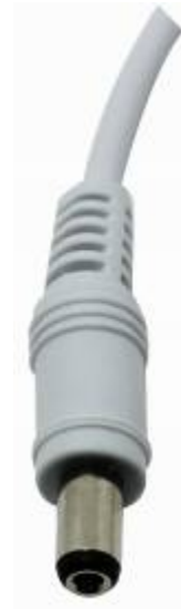
Output DC male: 5.5 x 2.1mm