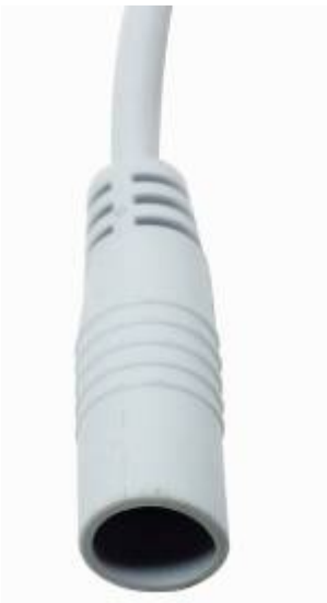
Input DC female: 5.5 x 2.1mm